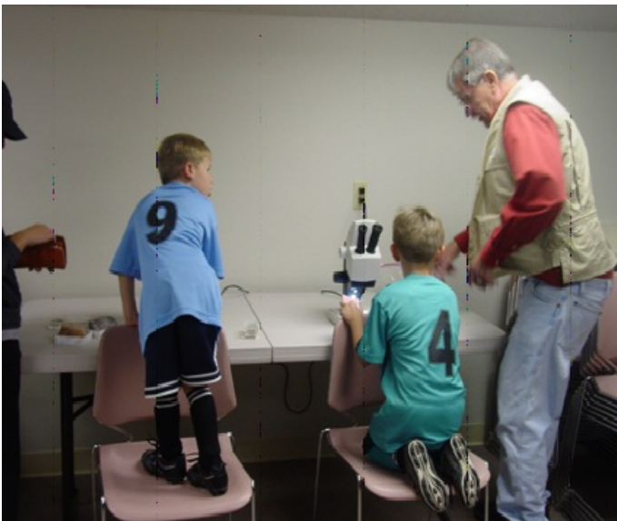
Getting a nice, close look