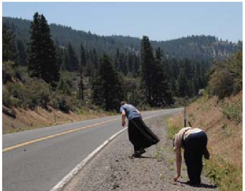
Finding agate & obsidian at a roadside cut