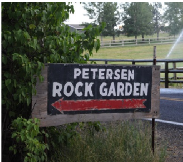
Not very nice rocks....

Ashland, for a smallish town, has much to offer; besides the three very nice theaters, there are a lot of very nice cafés and restaurants, with a lot of variety in cuisines. We visited the Sisters (3 mountains) and their eponymous town nearby- pretty touristy but what does one