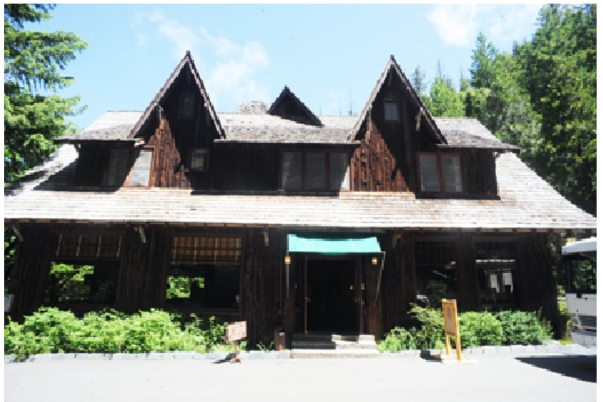
The lodge at The Oregon Caves

The caves were formed in a "marble mountain", eroded by slightly corrosive soda water. It was discovered by a hunter whose dog was chased by a bear. The hunter used up his matches and had to listen to the running water to find his way out, the dog having found his own way. In the afternoons, a cold draft comes from the cave entry. At sunset, we watched as bats emerged thru the