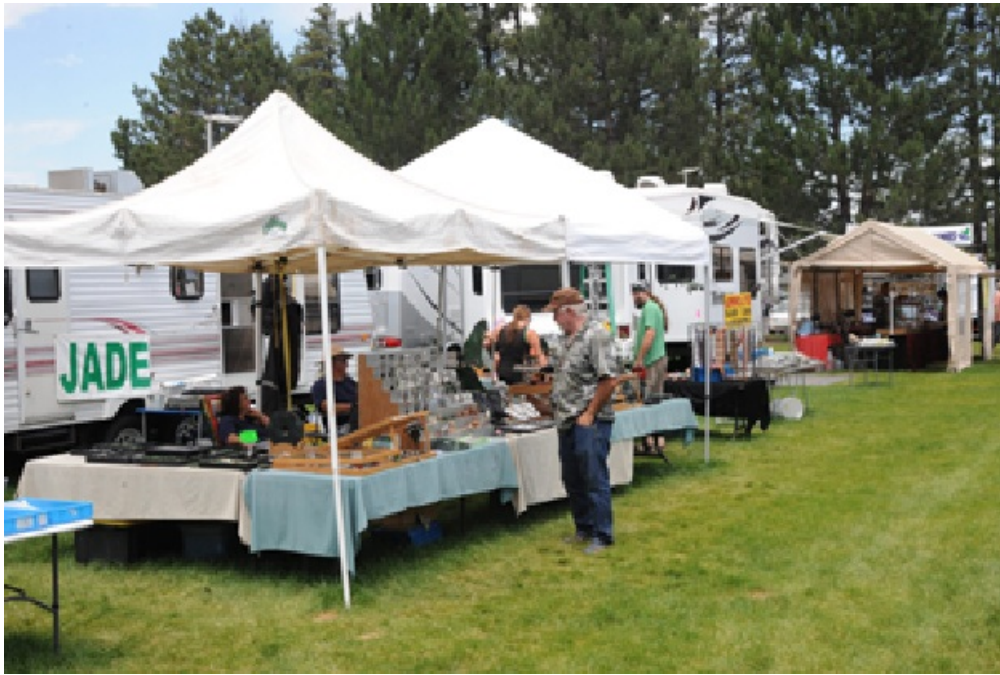
The annual Rock Show in Sisters, Oregon

rock shop in Cave Junction that we did not visit due to time constraints. On a side road were some black chunks of serpentine that John showed us; we collected a small bagful; they're soft enough for "easy" carving.