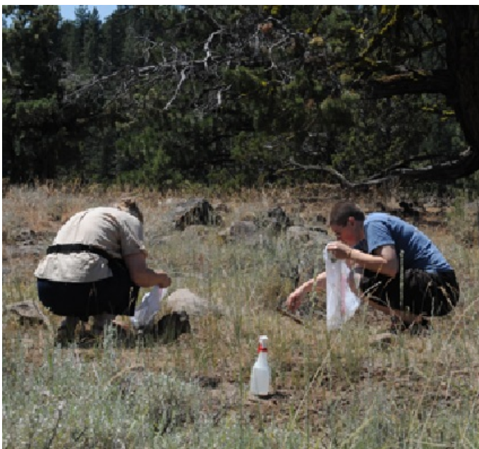
Finding obsidian, WAY off the beaten path!