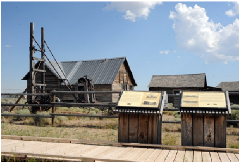
A restored "ghost town" near Fort Rock in the Oregon desert

to time constraints, but following advice found in Oregon Gem Trails (I think) we looked for- and found- agates and an obsidian nodule in a roadside cut. Very handy! We also followed directions to obsidian outcroppings, but the directions and trails (roads) to the site were not completely clear, nevertheless we found a scattered pile of obsidian flakes... nothing big but most likely leavings from other rockhounds' findings. Or so it appeared! Anyway after following highway 395 into Nevada, we stopped over in Reno to check out the local Basque restaurant downtown, leaving very, very stuffed with enough leftovers for another meal at home! So, if you're not hungry, NEVER go to a Basque restaurant! One last overnight at the local Ramada Inn (quite a view from the 8 th floor!) And home the next day... nearly 2100 miles and 12 days later! Fun!