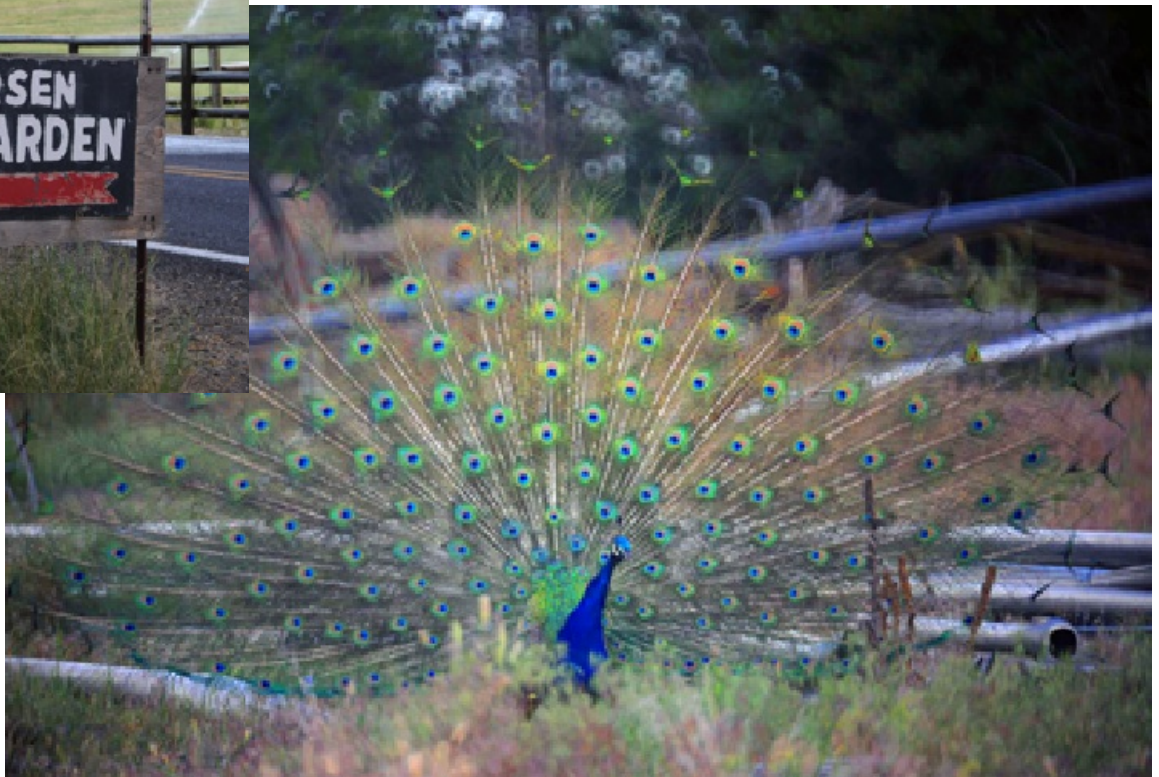
...but there were so many gorgeous peacocks & peahens at Peterson's!

expect? Mt. Bachelor is in the same range, easily visible from not only Sisters but Bend, as well! We drove across the Eastern Oregon desert, stopping to check out the Lava Tubes Monument, passing by the fairly close fossil beds monument(s) due