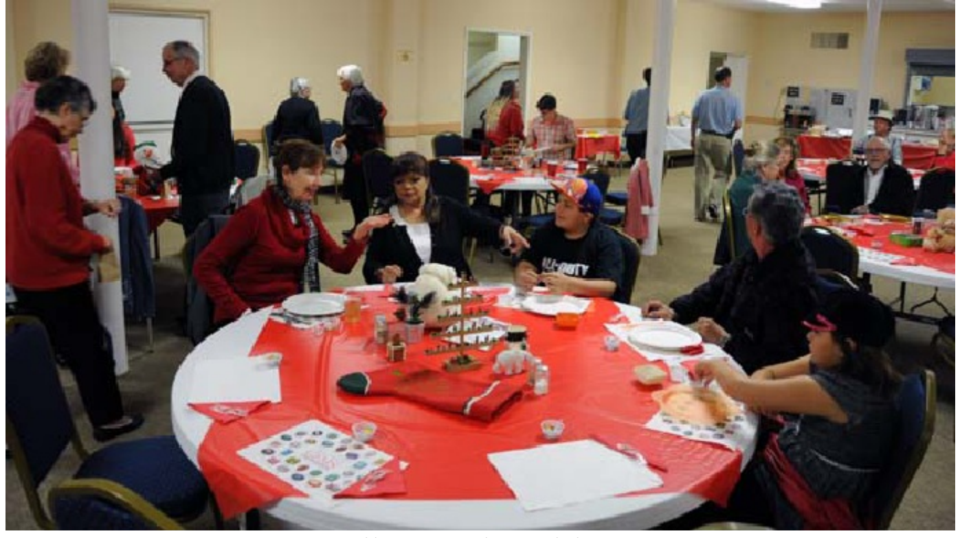
Lots of hungry members & their guests!