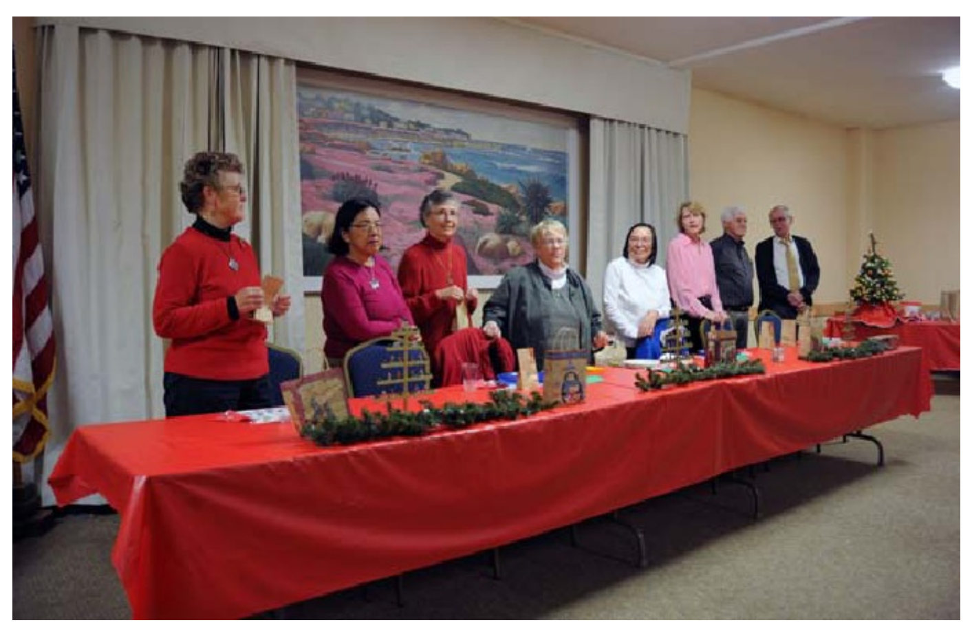
The Line-Up...The Usual Suspects, of course!