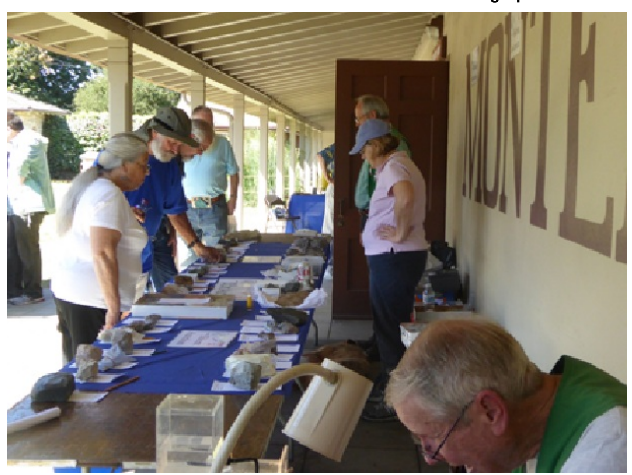
The silent (but very profitable!) Auction...