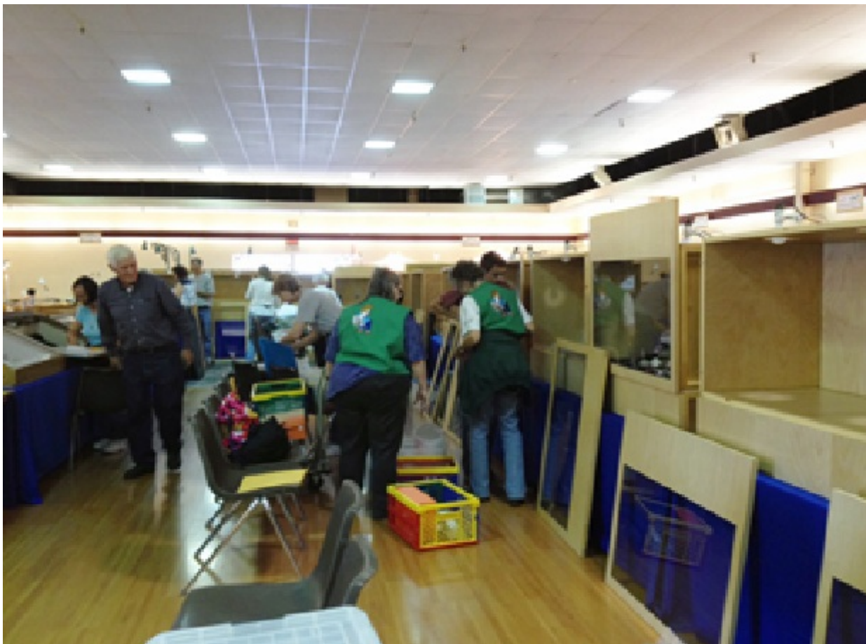
Putting it all away for next year

toner-stained little (?) hands on, no matter the subject matter, and make it available online (if possible) on the club website, or else for some future slideshow- whatever anyone wants! And again, thanks, everyone for the submittals and photos! Nice job, everyone! -Rich