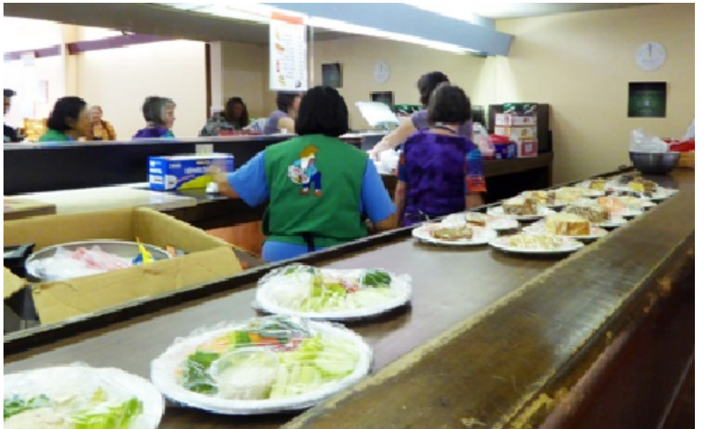
The snack bar crew, busy at work