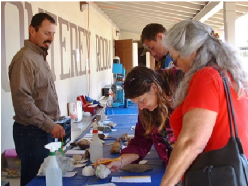
The Silent Auction