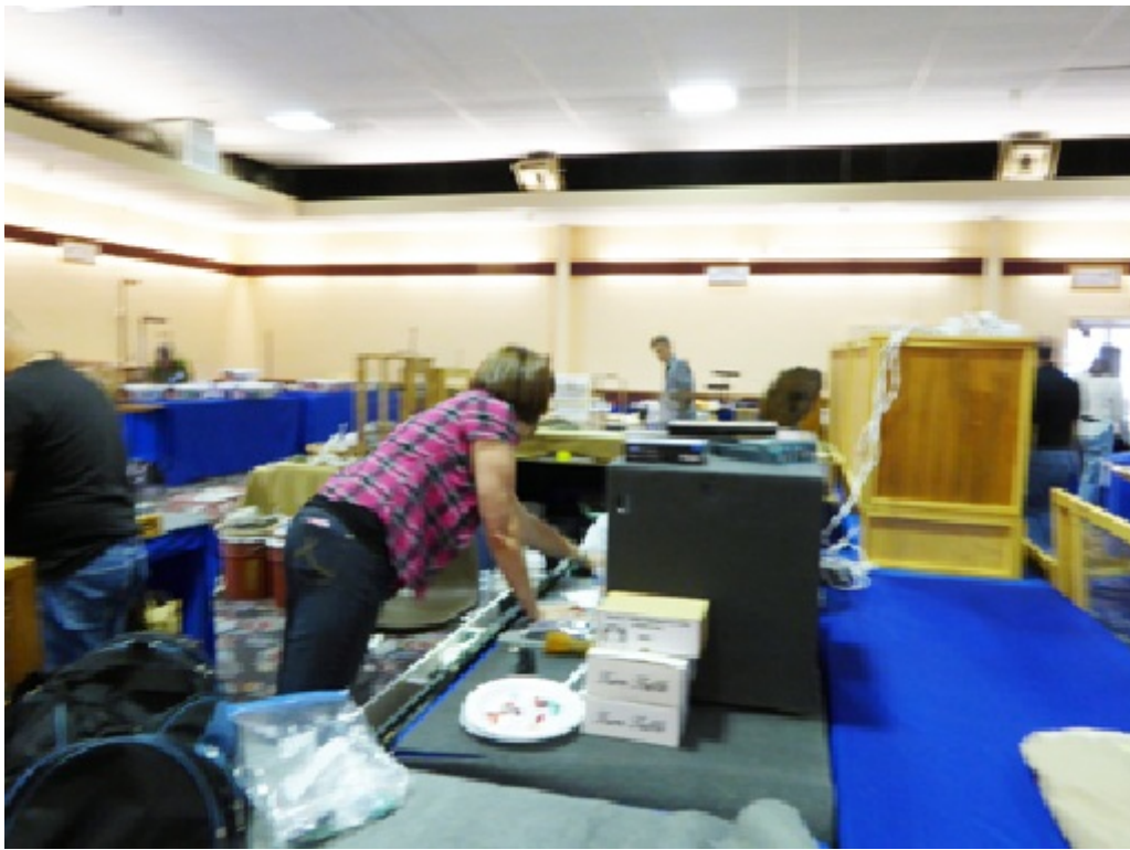
5 PM Sunday

Editor's notes: this year, there were lots & lots of photos, many I took, many others submitted by members. So many that there was no way to place a selection of them in The Prospector without being unfair to those not included; they were all so good! So instead of the usual collection of photos of people checking out the dealers, display cases & so on, this year I decided to concentrate on the volunteers who make this show possible- every year! So that's what's in this year's Show Issue! However- I'll put together a CD as soon as I have the time and include every photo I can get my