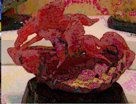
Rhodochrosite Rides Again...