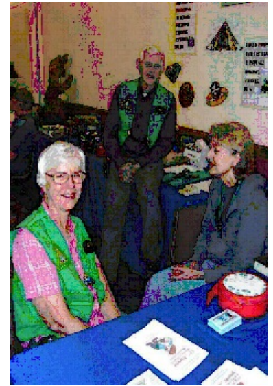
Some of our happy crew...