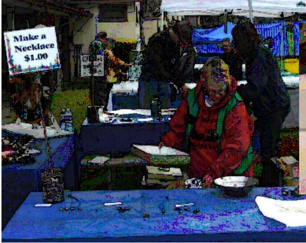
Prez Susie digs in...