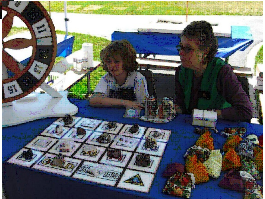
Talma & helper man the Wheel of Fortune...