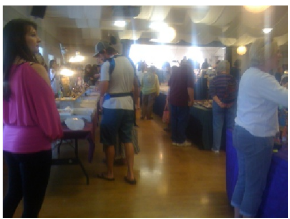
The Cayucos Show

I sure can! Any other photos, as well, guys... -ed.