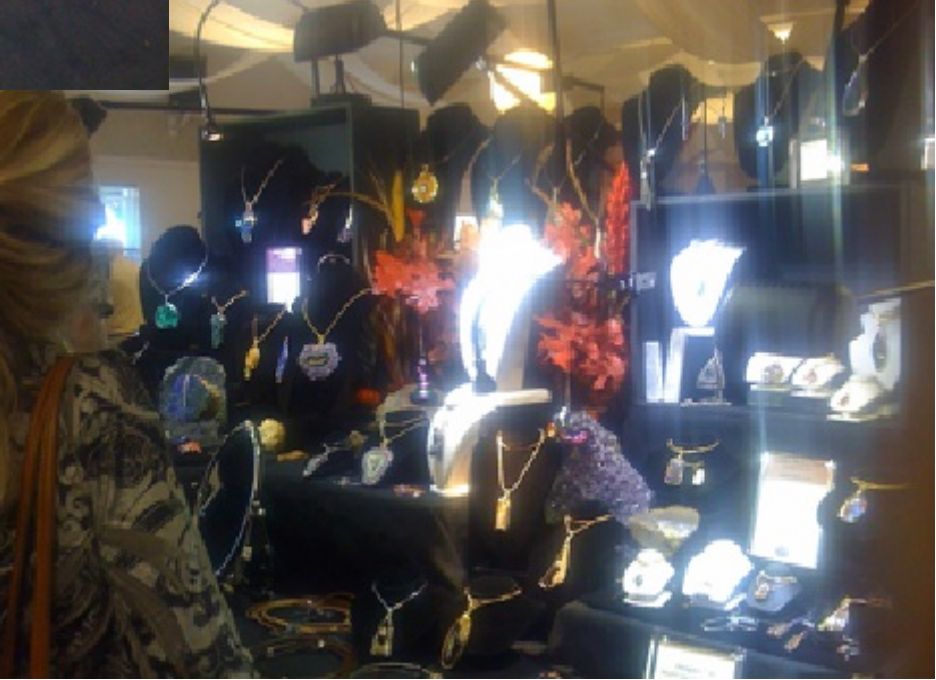
I just HAD to take a photo of this display... so pretty! -Suzie