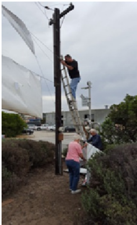
Going up... JR