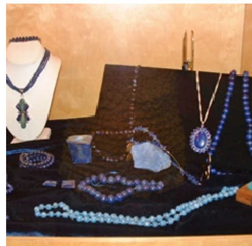
MaryJane's lapis necklaces... AW