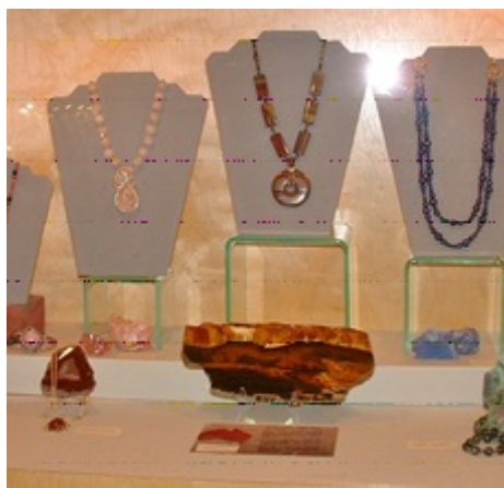
Karin's necklaces... AW