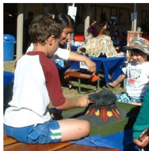
Some happy kids!