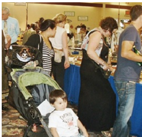
Nice crowd! AW