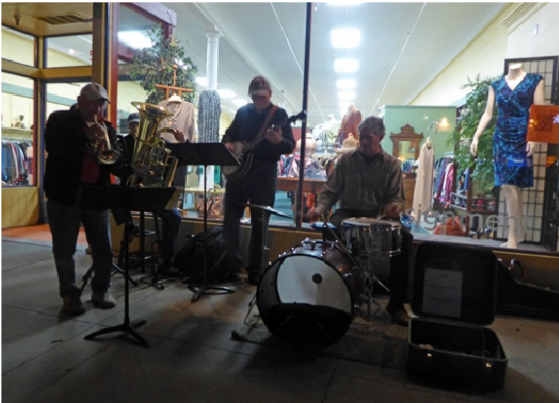
Dixieland comes to P.G. ...