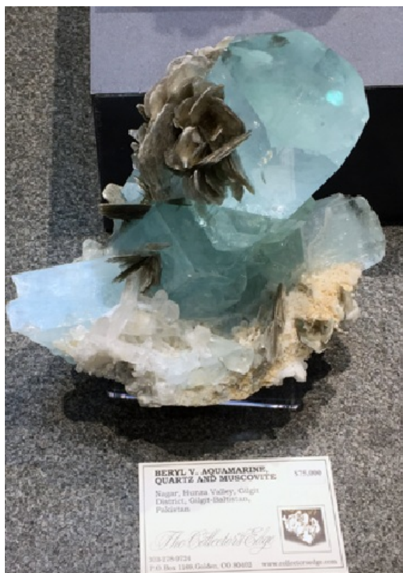
Aquamarine, Quartz, and Muscovite