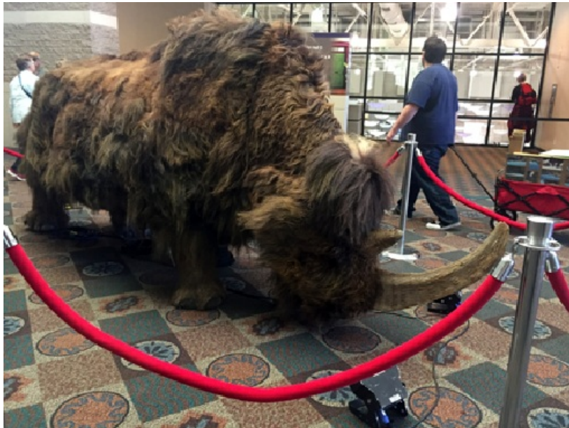
I believe this is a Woolly Rhinoceros. Very, VERY wooly...