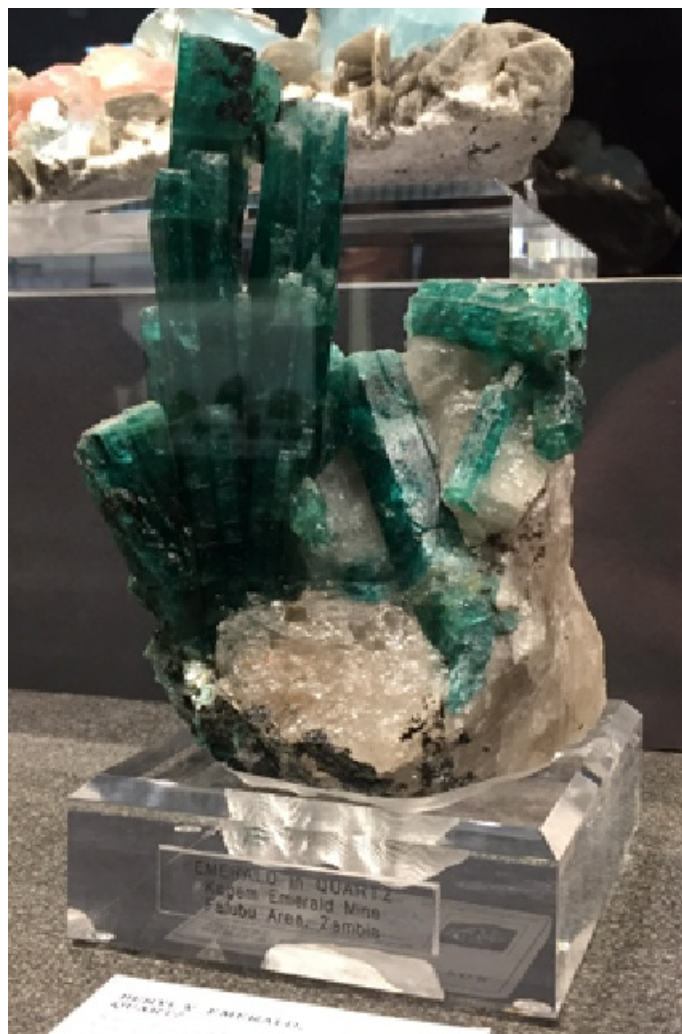
Emerald in quartz