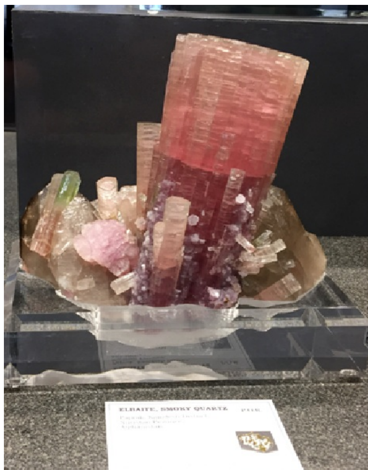
Elbaite, Smoky Quartz