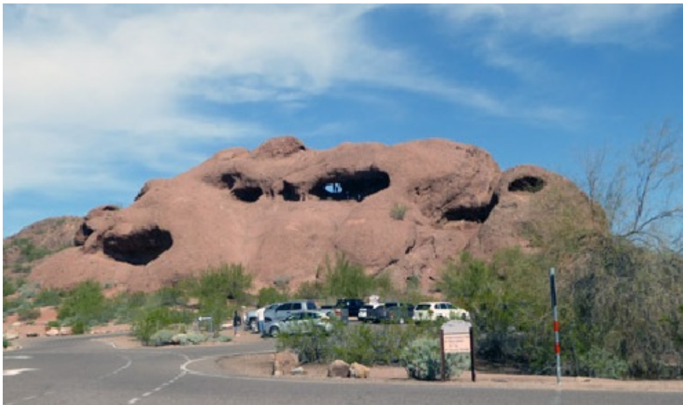
The "Hole-In-Rock", Papago Park, Phoenix

Speaking of museums, Phoenix also has one of the most outstanding museums I never heard of before.. A Musical Instrument Museum! This facility has- they say- over 15,000 musical instruments, from Ancient Egypt to the modern day, and everything in between! Suffice to say I really only have