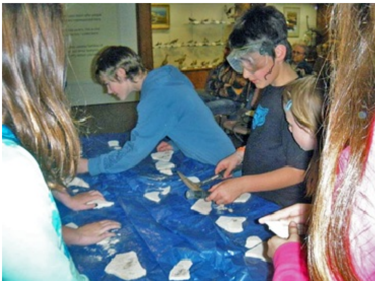
Looking for Green River Formation fossils

Our program on Friday March 11 will be a Show and Tell Session. Those who went to Tucson can show off their latest goodies. Others can share some of their favorite items from their collections. It's always fun to see what our individual members are interested in.