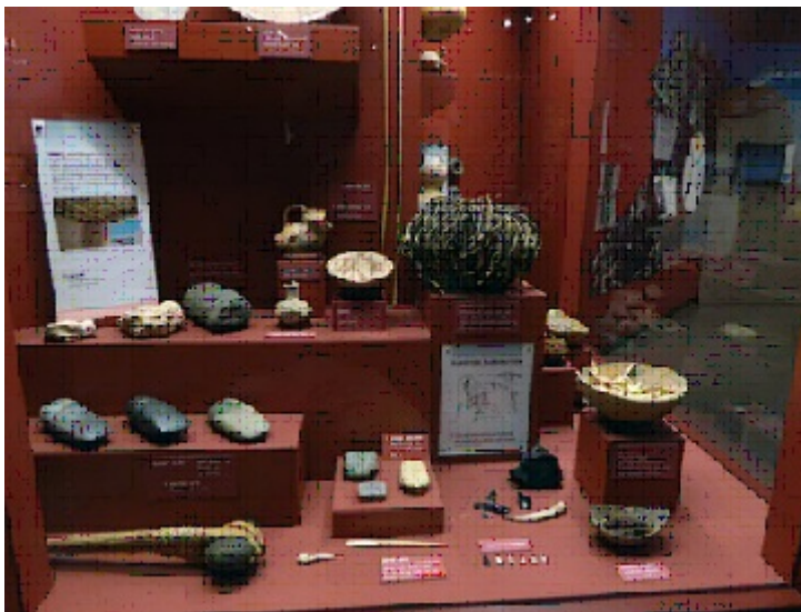
One of the many fascinating exhibits at the Heard Museum, Phoenix

southwestern tribal life and historical pre-Columbian displays. In the middle of downtown Phoenix (a VERY large city!) was the archaeological site called “Pueblo Grande”, which features partly excavated ruins of an ancient native culture with some rooms having