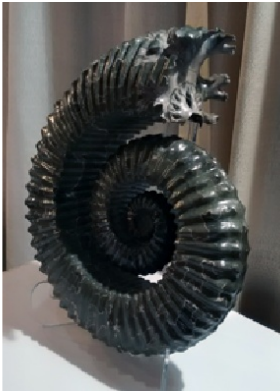
Giant ammonite in Tucson...