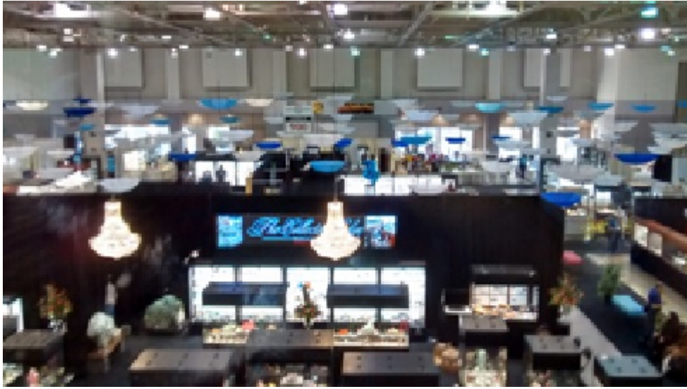
The Main Event, Tucson

trying to keep up. What-to-see-next; so many exhibits & dealers, so VERY little time! The most impressive of what I managed to see were a pair of truly large ammonites, from Madagascar, I believe, being sold by a Russian dealer. We talked about price, and the figure "$50,000 each" came up... I did manage to take some photos, but only with my cell phone, not my far better camera...having been thrown off kilter a bit by the Coughing Crud, I'd carefully forgotten I'd put the camera battery in the charger in the room, where it stayed for our trip to the main event.