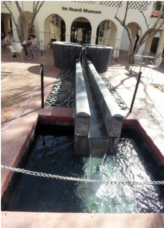
An aqueous entry to the Heard Museum

Speaking of museums, Phoenix also has one of the most outstanding museums I never heard of before.. A Musical Instrument Museum! This facility has- they say- over 15,000 musical instruments, from Ancient Egypt to the modern day, and everything in between! Suffice to say I really only have