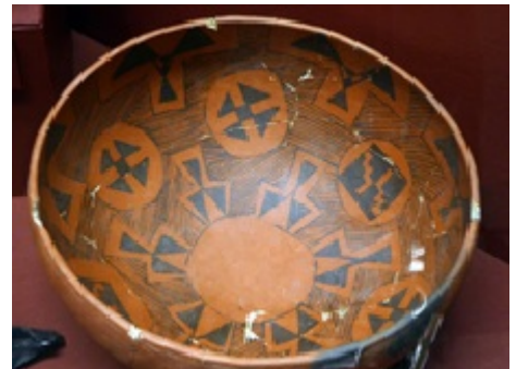
Hohokam Bowl at the Heard

There were far too many exhibits to mention, but suffice to say the quality & size of the collection in the Heard Museum is truly outstanding!