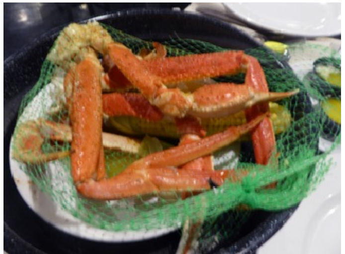
Crab legs (and much more!) at Joe’s...

So we packed up the ol’ Prius and took off, stopping in Long Beach to visit an ailing aunt. Off to Q & Phoenix the next day (I LOVE getting out of LA, which is really no excuse for being there in the first place...) and a few hours later were buzzing thru Quartzsite...been there, done that, so we didn’t even slow down! Got to our hotel in Phoenix (very nice one, the Hotel Tempe Inn Suites, near the airport on Baseline Rd.), and decided that all that driving had taken the starch out of us, so the nearest restaurant was just across the street, “Joe’s Crab Shack!” where we went for dinner. Big servings, so Martha & I split a big salad & a dinner-in- a- galvanized -pot affair. Wonderful and VERY filling, crab shells everywhere, no room for dessert. We were stuffed! Anyway more about this dinner later... so we’d planned on taking in Phoenix for a couple of days, and planned on leaving for Tucson on the 11 th , which we did after taking in a few of the many sights Phoenix has to offer. We went to the Heard Museum, which has an INCREDIBLE collection of Indian artifacts and many, many displays featuring