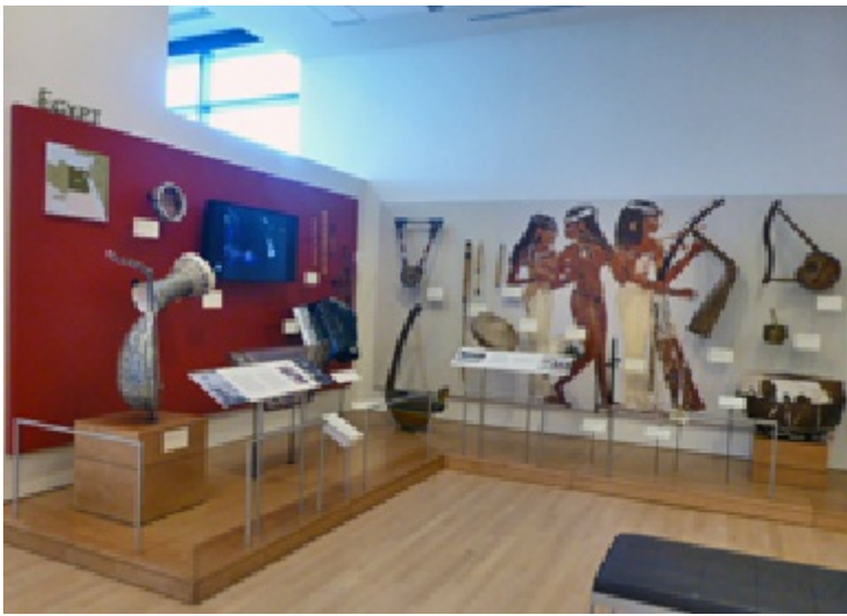
The Egyptian Exhibit at the Musical Instrument Museum, Phoenix

newsletter...well, for this reason: we all love rocks, minerals, jewels, fossils & such BUT if you're going to make such a long trip it would be remiss to not take advantage of the availability of so many other things to experience, and since not too many articles are around about what to see while taking in Tucson, etc. during a road trip from Monterey here's your chance to at least see what we were able to fit in. Just some of it anyway.