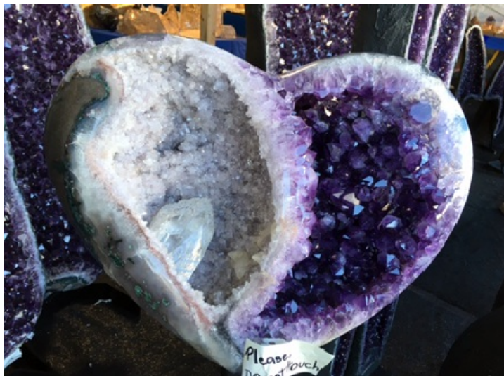
1 amethyst, 2 colors... Tucson