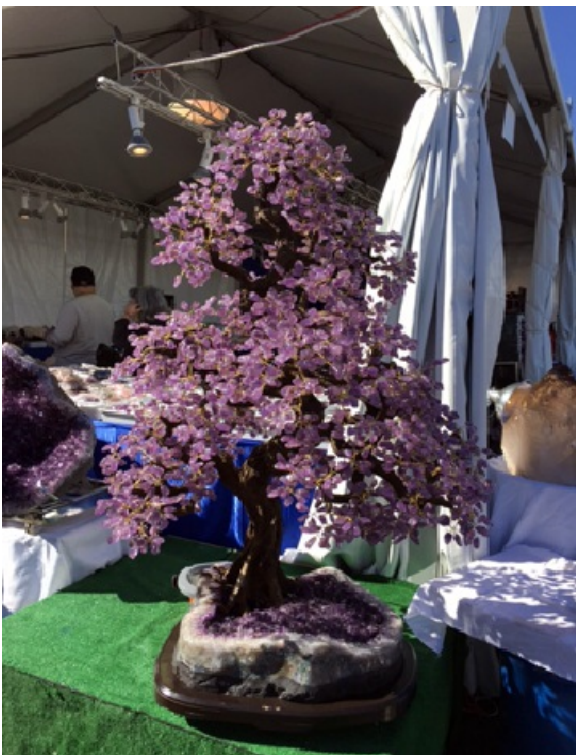
Gem tree at Riverpark