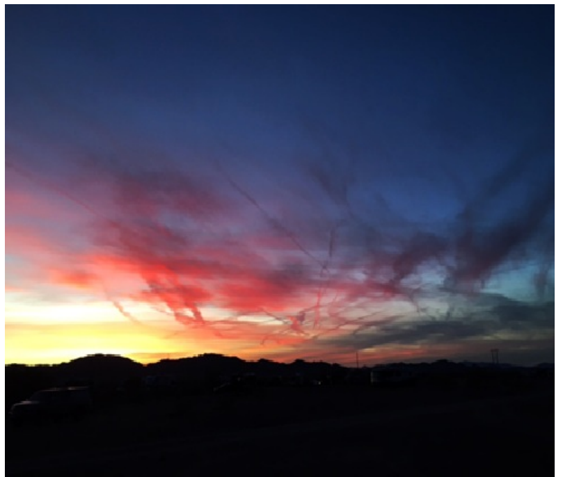
Sunset in Quartzsite, on the way home...