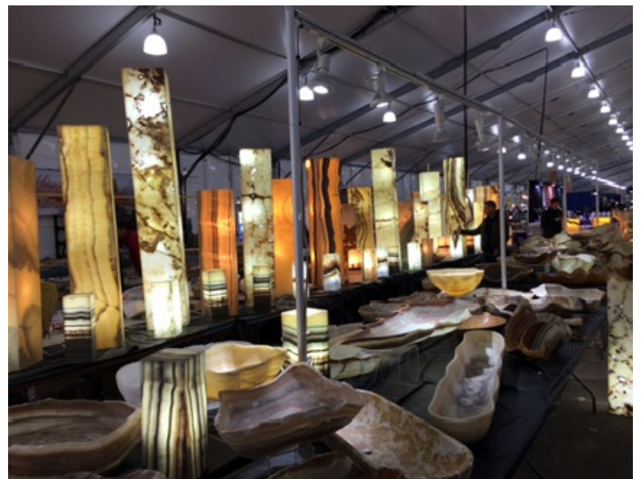
Onyx lamps, 22 nd Street