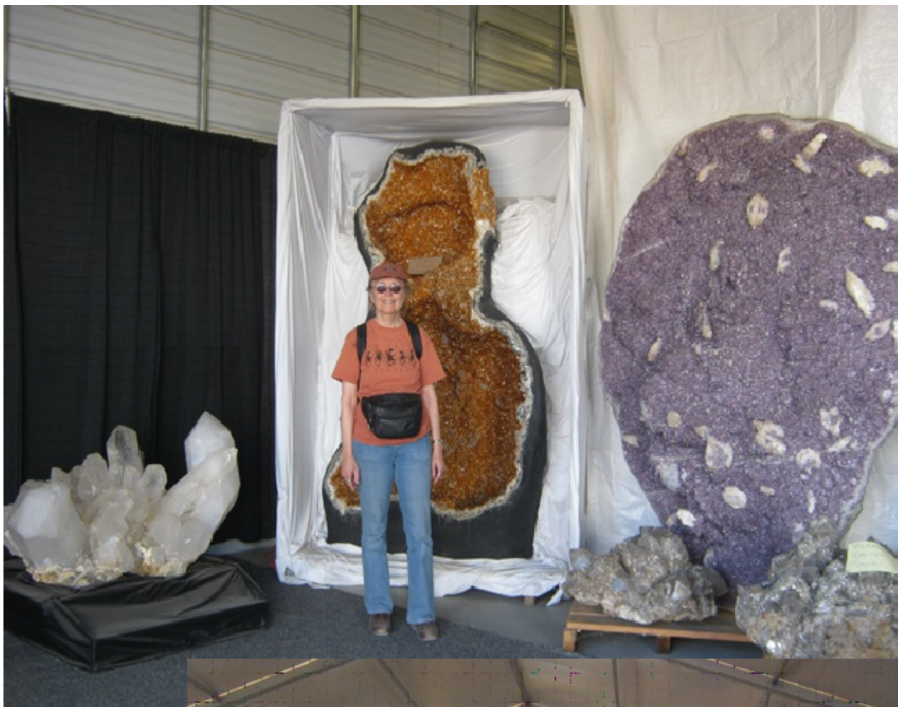
Talma between a citrine geode, quartz crystals and an amethyst 'plate' with calcite crystals.