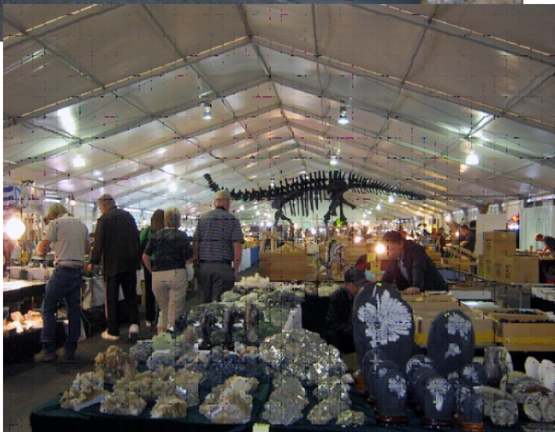
One of the hundreds of tents with vendor after vendor.....notice the apatasaurus (formerly called brontasaurus).