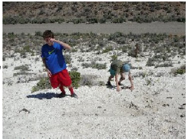
Collecting opalite near Lovelock, NV ...