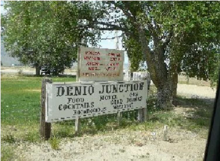
NW Nevada, gas is not available here