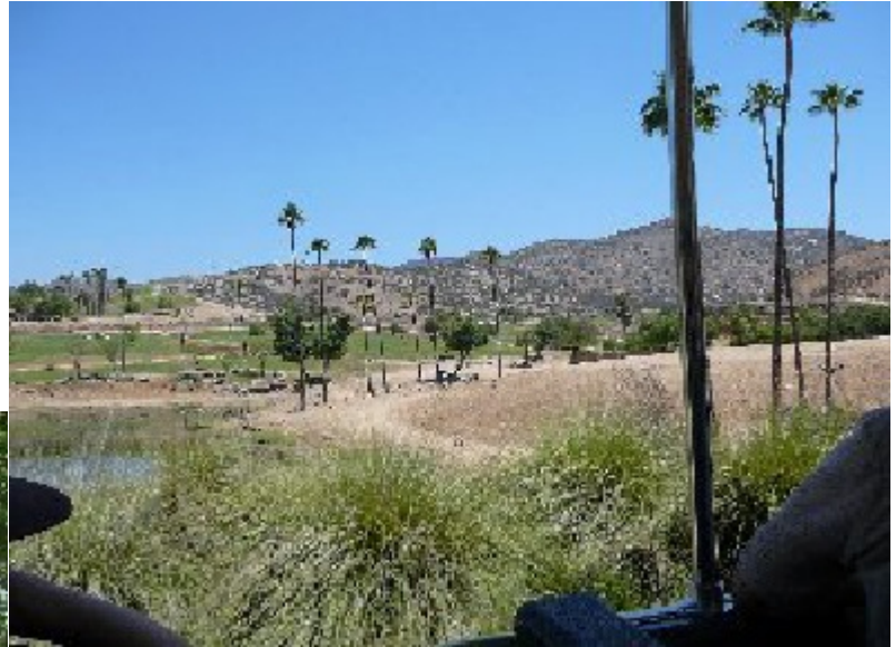
San Diego Wild Animal Park