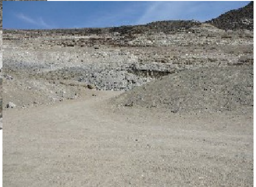
Tailings at the Royal Peacock Mine