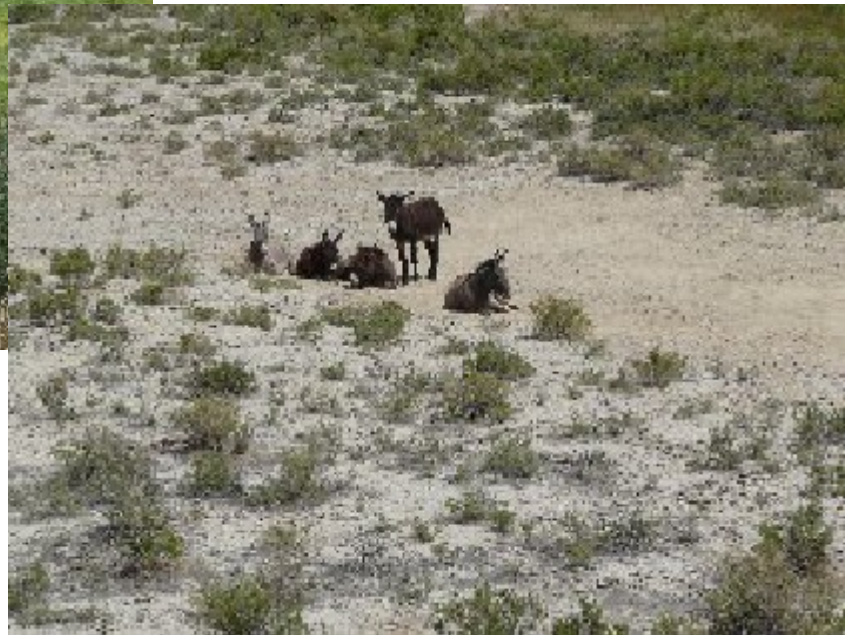
... and Donkeys near the Royal Peacock Mine