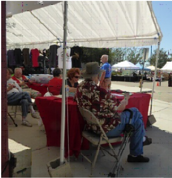
The Welcoming Committee...

And... a HUGE number of outdoor sales booths, I don't recall that many previously but maybe my recollection is faulty.