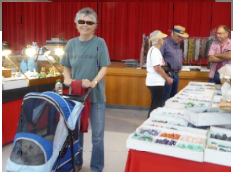
The Usual Suspects AND a new friend...