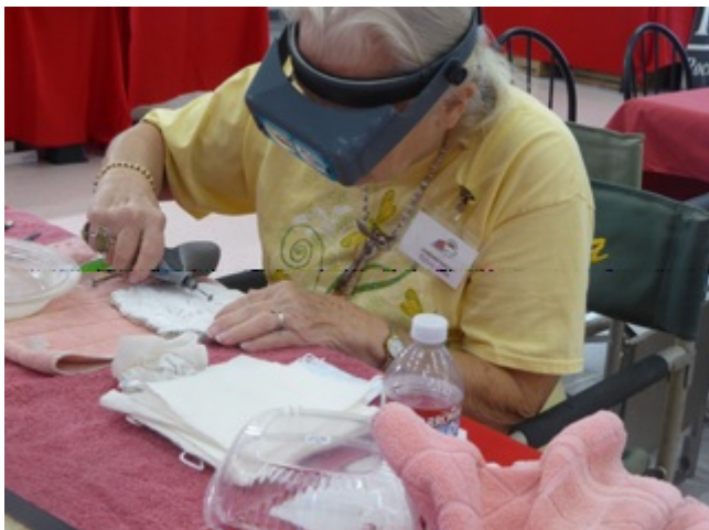
A Carving Demo...