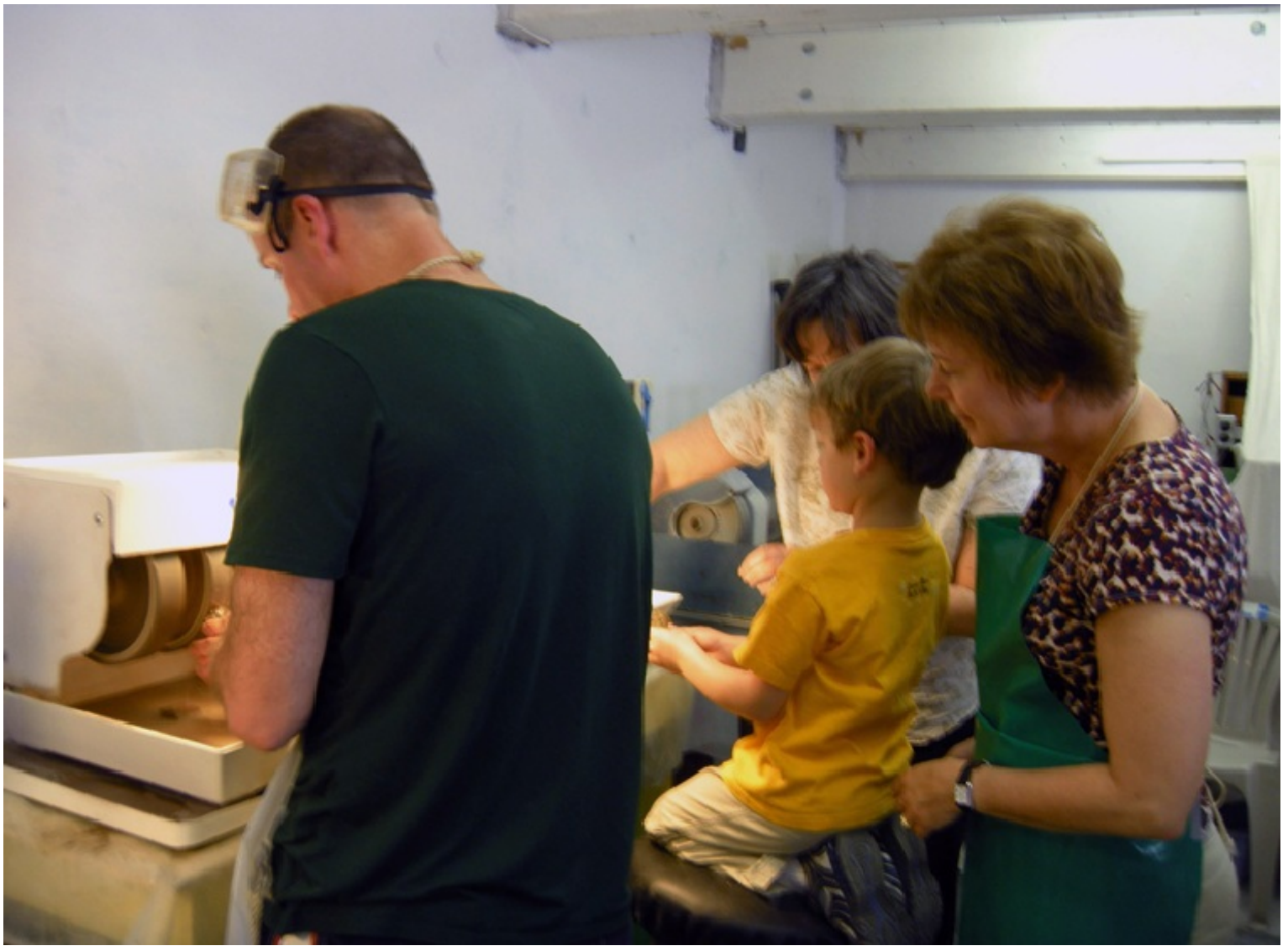
Everybody gets in on the act!