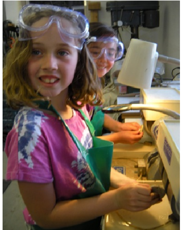
Pebble Pups can do it, too!